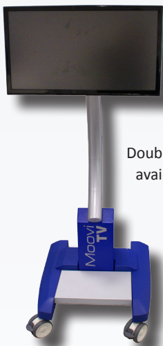
Double stem version available for large screens